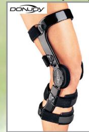
Defiance brace by DonJoy